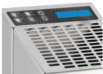
O3 Tower Top controls