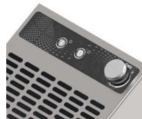
O3 Tower controls