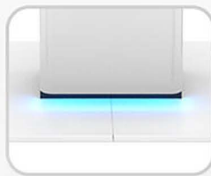
LED Atmosphere Lamp