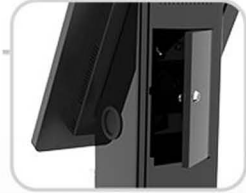
Lockable Cable Compartment For internal wiring