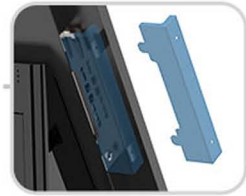
Cable Cover Keep wires and switches from being damaged in public