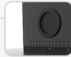
Wire Routing Hole