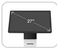
Touchscreen Support landscape or portrait mounting