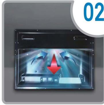
Outstanding Aluminum Ventilation Frame