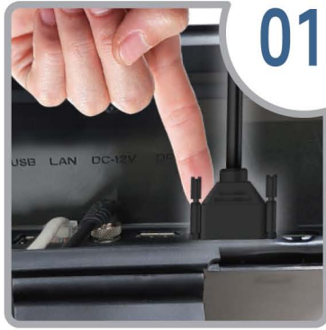
Wide space for I/O Port connection