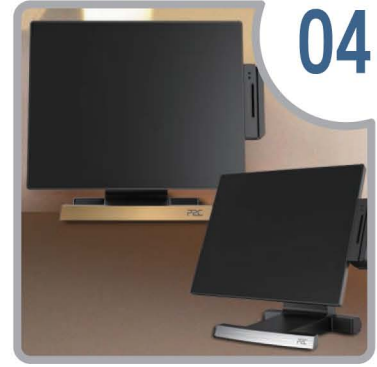
Luxurious metal style of Premium logo bar