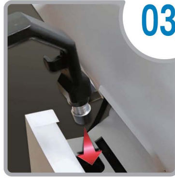
One-touch type of Dual monitor connection (Patent application)