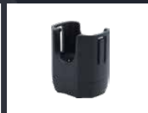
Ring-shaped direct charger