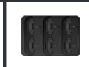
Six-slot Battery Charger