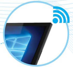
Wireless + Bluetooth