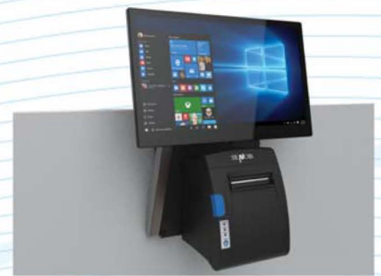
Wall Mount with Printer