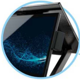
11.6" / 15.6" Customer Display with Accessories*