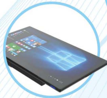
Ultra-thin 10mm Panel