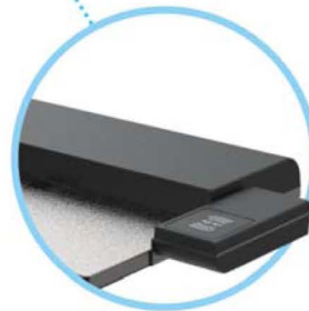
RFID / Fingerprint Reader