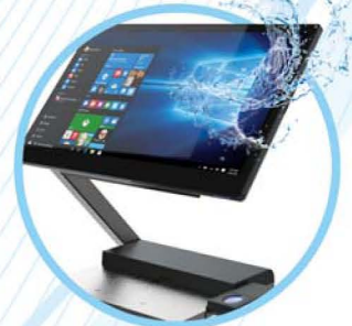
IP54 Whole Unit