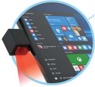
2D Barcode Reader