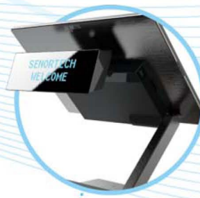
VFD Customer Display