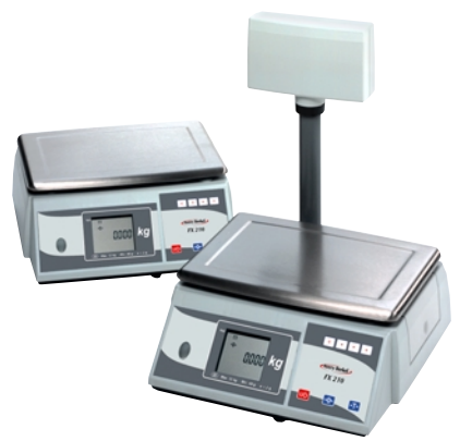
FX 210 weight only scale for general weighing applications.