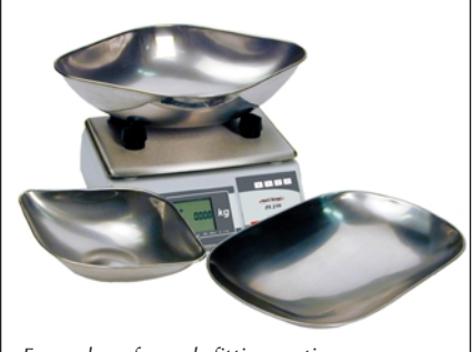
Examples of goods fitting options.