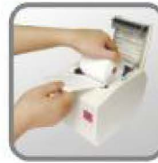
Paper Easy loading

Widely used in bill printing in lottery, supermarkets, restaurants and chain stores. etc