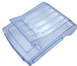
Spill proof cover