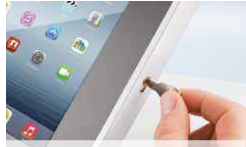
Unobtrusive and impressively practical: the integrated lock provides secure protection against theft.