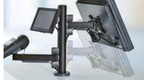
Infinitely variable in height, the arms let you position terminals, keyboards and monitors wherever you choose.