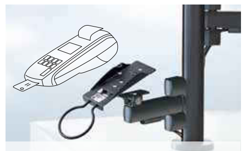
Customised mounting options for attaching brand-specific peripheral devices.