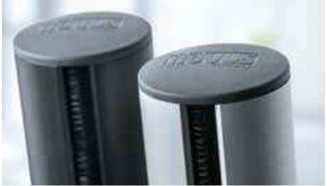
High-quality silver- or black anodised aluminium profiles. Cables are routed through the inside of the column where they are concealed by practical brush seals.