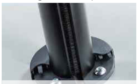
2-in-1: Screw-on and screw-through attachment for using existing means of attachment.