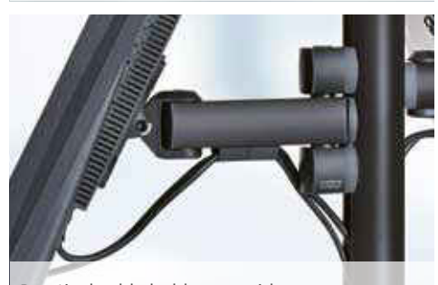
Practical cable holders provide secure, neatly organised cable management on the arm.