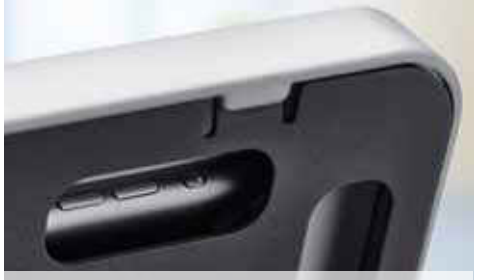
Control functions remain accessible by the practical apertures. If not used, they can be closed off with cover caps.