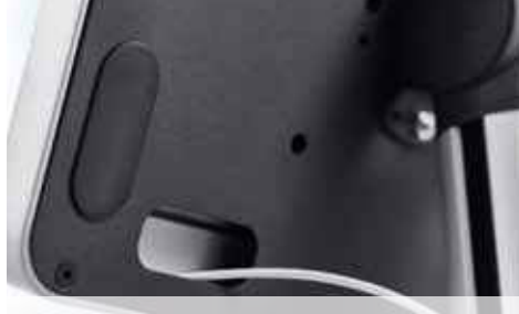
Alternatively the connect joint enables a turning of 360 degrees.