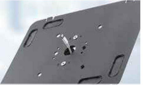
The TabletSafe or connect plate is securely attached to the connect joint. Perfect cable management hides cables from view. With internal cable routing, the tablet / device can be turned +/- 45 degrees in each direction.