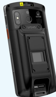
Optical Fingerprint Module