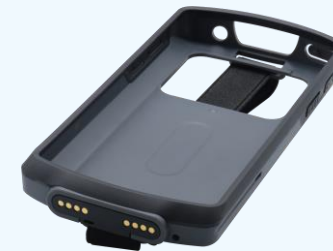
Two-tone Protective Shell