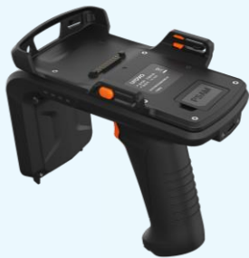
UHF Gun Grip