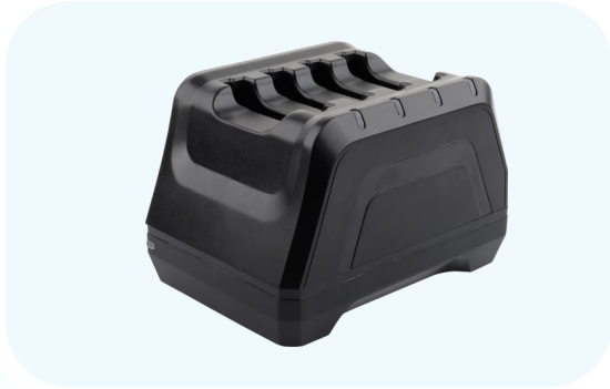
4-Slot Battery Charging Cradle