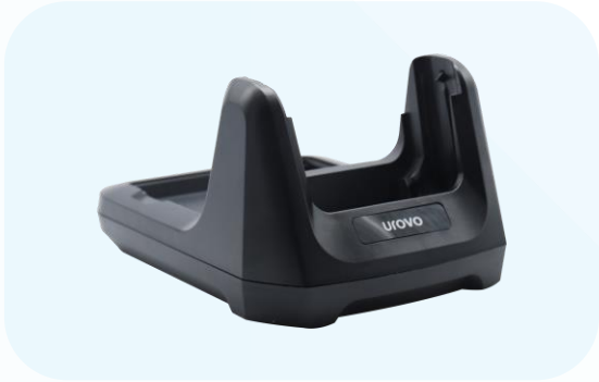
Single Charging Cradle