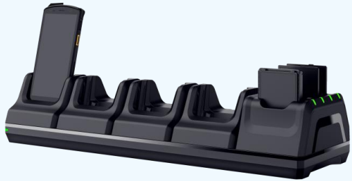
5-Slot Charging Cradle (4 terminals, 4 batteries)